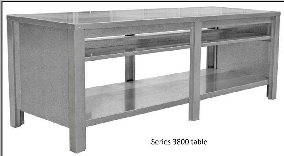
Series 3800 table

Front and back 12” deep tool shelves are standard on all tables