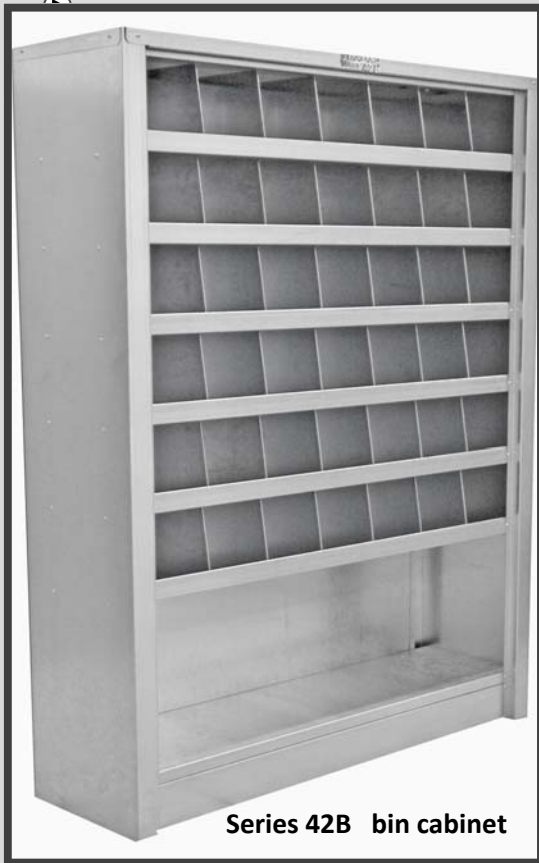
Series 42B bin cabinet