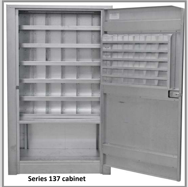
Series 137 cabinet